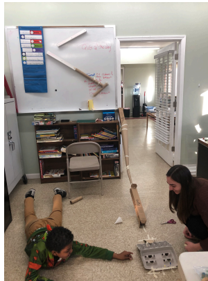
Problem Solving a Marble Run