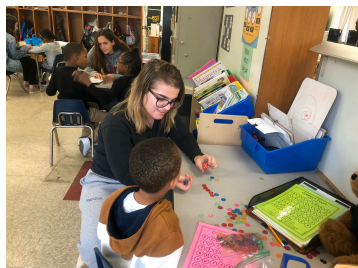
One-on-one math support