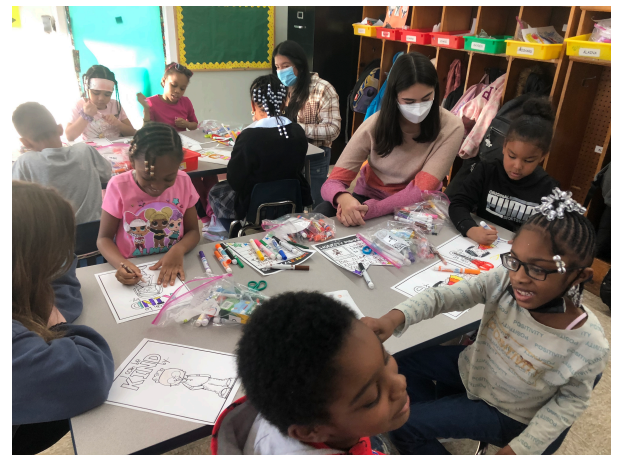
Providing Support and Encouragement during Activities