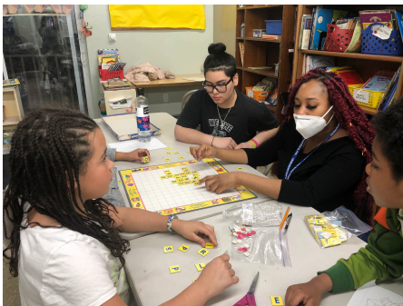
Playing a board game together