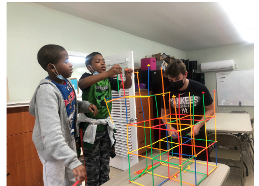
S.T.E.M Challenge Brainstorming